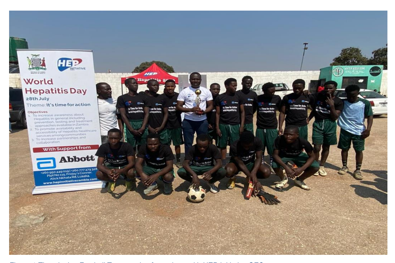
Figure 1 The winning Football Team posing for a photo with HEP Initiative CEO