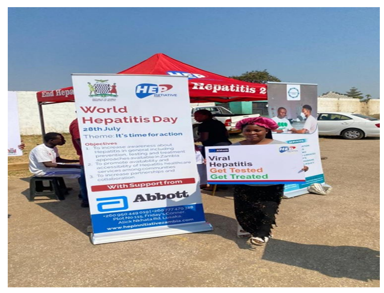
Figure 9 Community participation on awareness creation