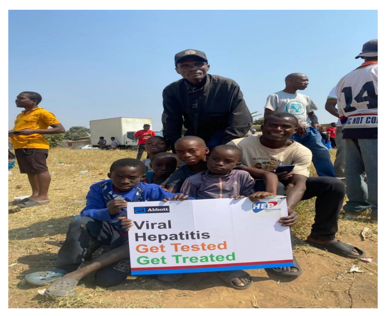
Figure 10 Leaving no one behind in hepatitis awareness creation