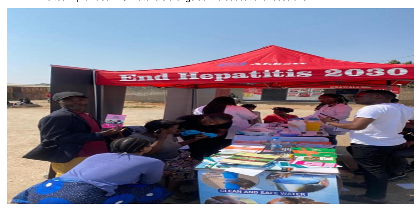
Figure 3 The HEP Initiative and MOH Teams provided educational sessions