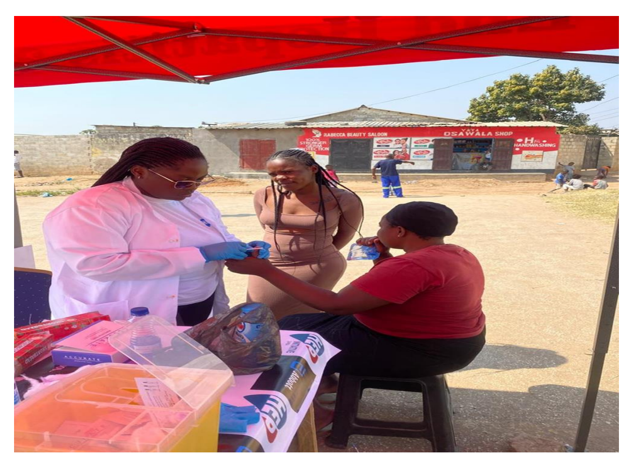
Figure 5 Free onsite testing for Hepatitis