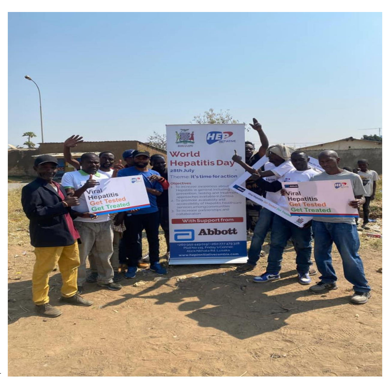
Figure 8 Community members taking part in raising placards with hepatitis messaging