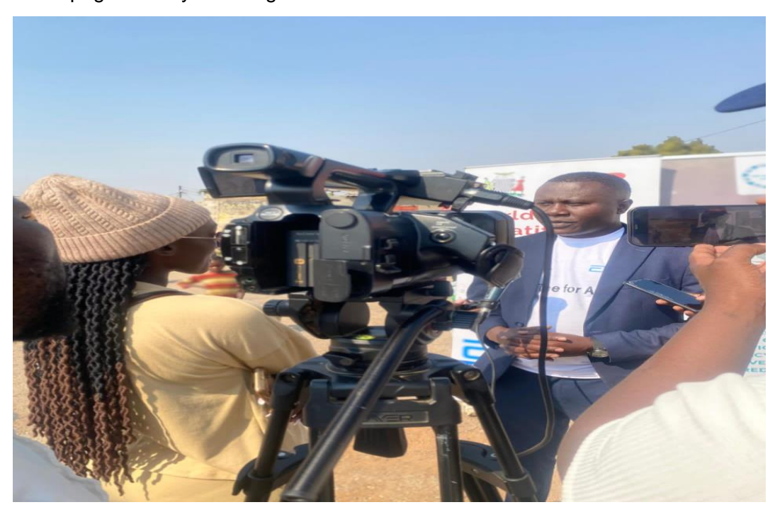
Figure 6 HEP Initiative CEO being interviewed by the Journalist from Zambia National Broadcasting Cooperation ZNBC

The event received extensive media coverage from the National Broadcaster and the Ministry of Health communications team. The Media houses helped amplify the messages, reaching a wider audience and raising public awareness. The event was equally published on the Ministry of Health Social media page thereby reaching a wide audience.